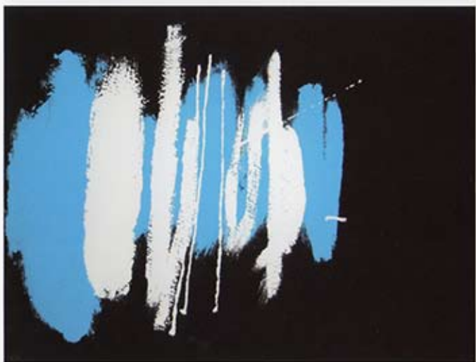
Yellow and Blue , 2000, acrylic on canvas, 122 x 152.5 cm