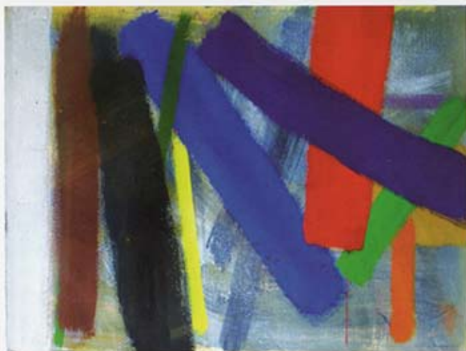
Summer Painting No.2 , 1985, oil on canvas, 92 × 124 cm