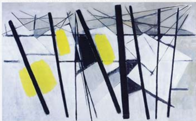
Composition-Sea , 1954, oil on canvas, 46 x 61 cm.